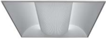
1x4 | 2x2 | 2x4

Curved one-piece housing with perforated center basket and frosted side diffusers provide a soft and balanced appearance for exceptional visual comfort.