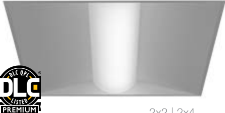
2x2 | 2x4

Designed for shallow plenum applications with a classic aesthetic. Even illumination and high efficiency at a competitive price point.