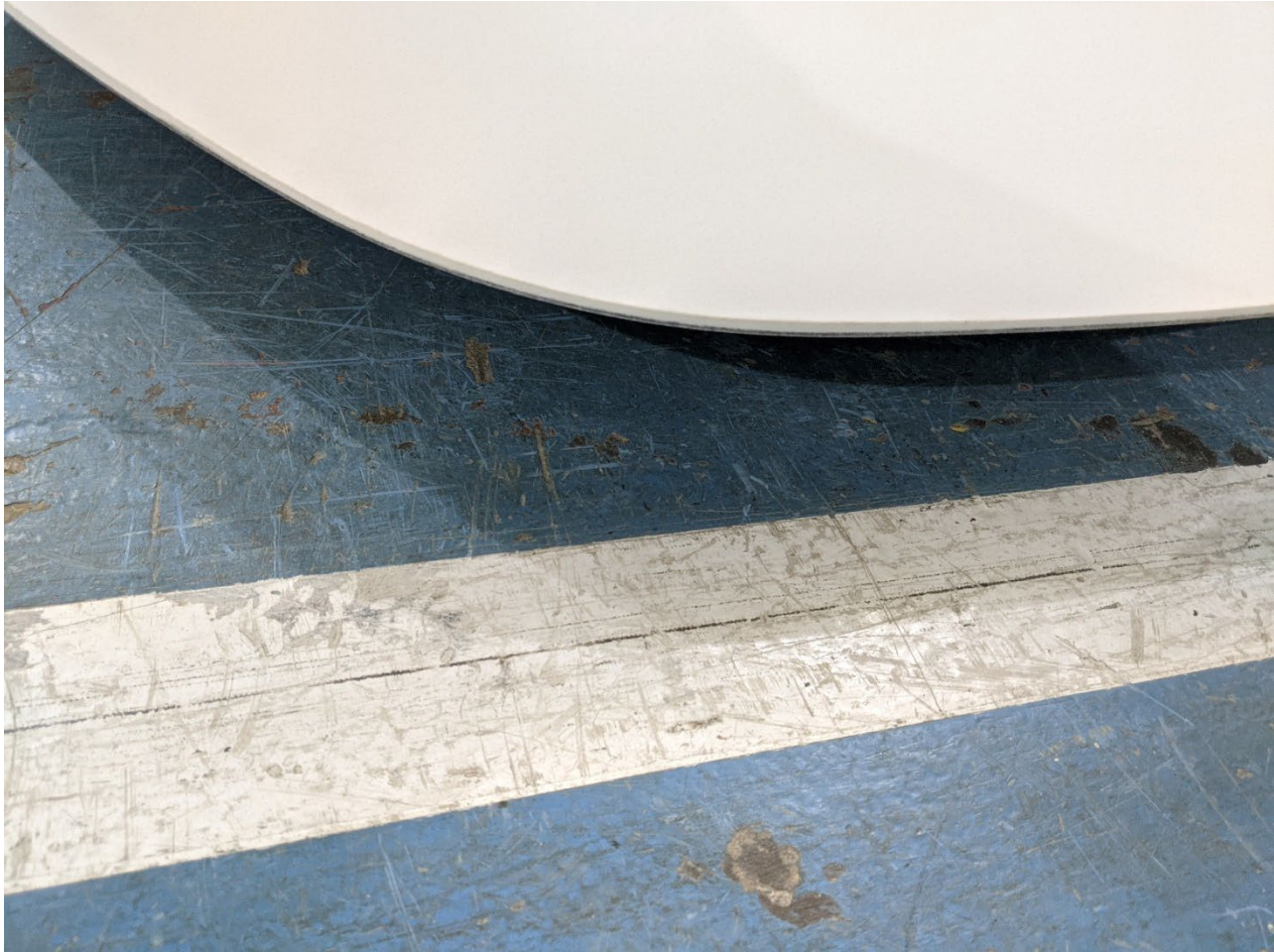
Figure 3 – Detail of specimen materials