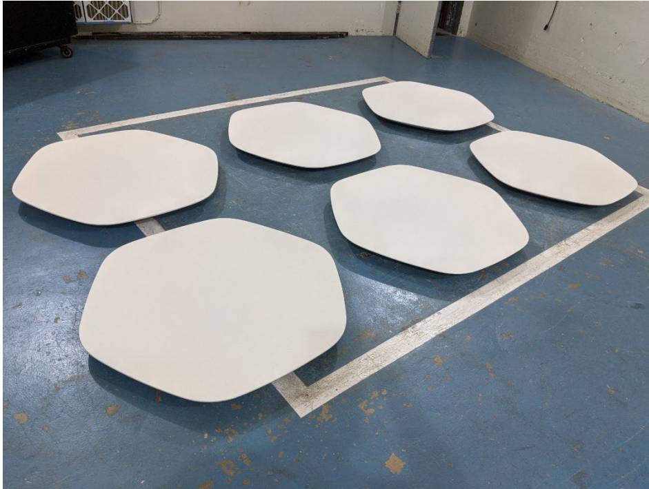
Figure 1 – Specimen mounted in test chamber